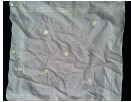
Flying hanky with light-points